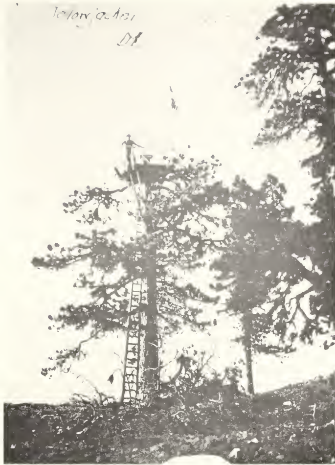
Figure 11. Lookout tree on Yellowjacket Ridge, 1917. The long-abandoned crow's nest is still in place.

The Preliminary Inventory includes most of the Forest's pre-Depression lookout sites. Three of these are the remnants of lookout trees (Huckleberry Mtn., Brush Mtn. and Yellowjacket Ridge). Two sites include the two remaining cupola-type lookout structures (Dutchman Lookout and Hershberger Lookout).